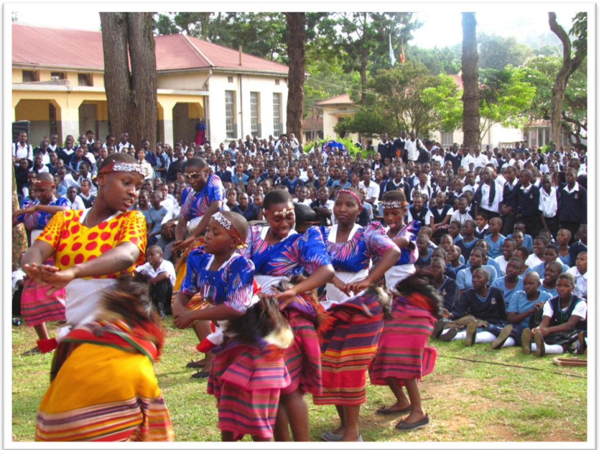
There was a festive atmosphere, complete with African and Indian dances