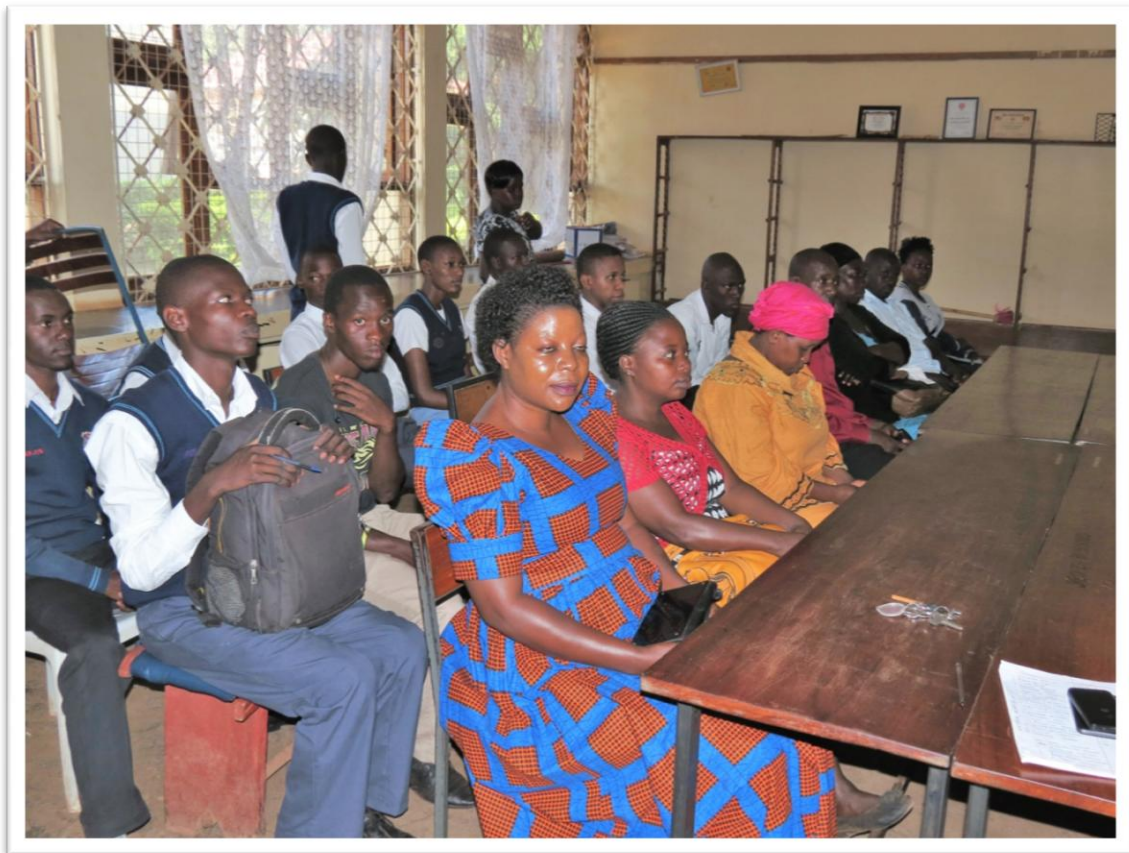
Scholarship students with their parents at the meeting with OKASFund trustees