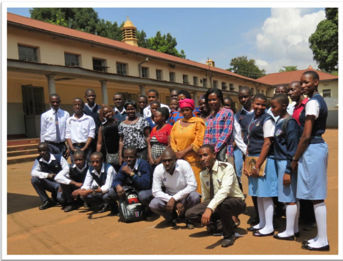
Current scholarship students with their parents