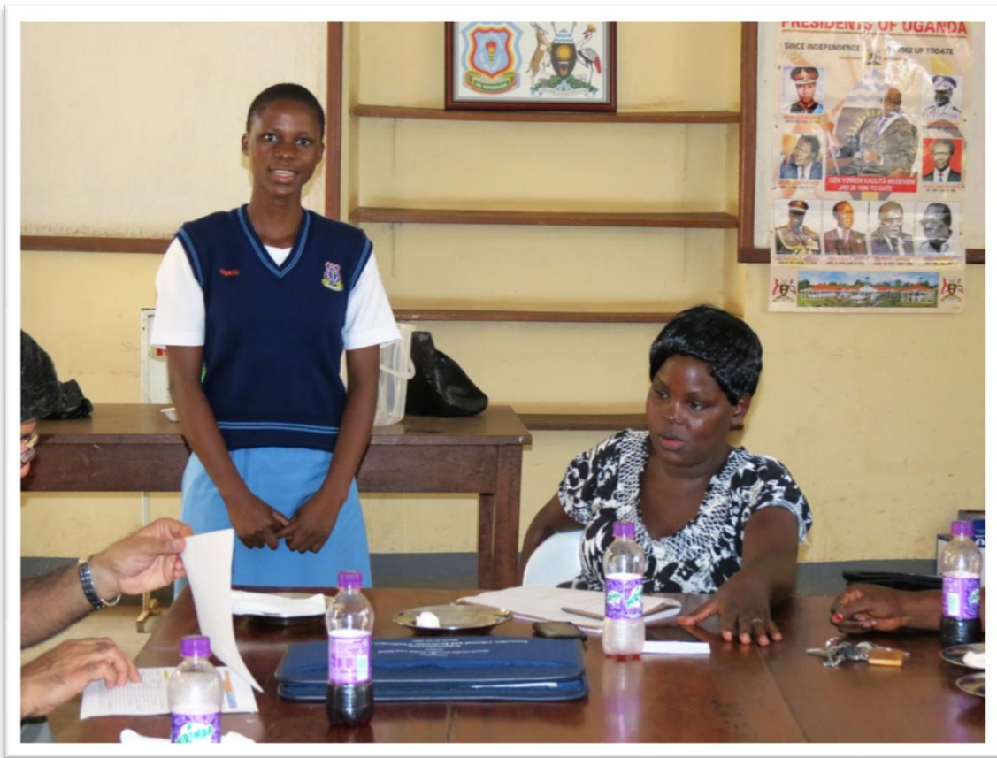
Another scholarship student speaks