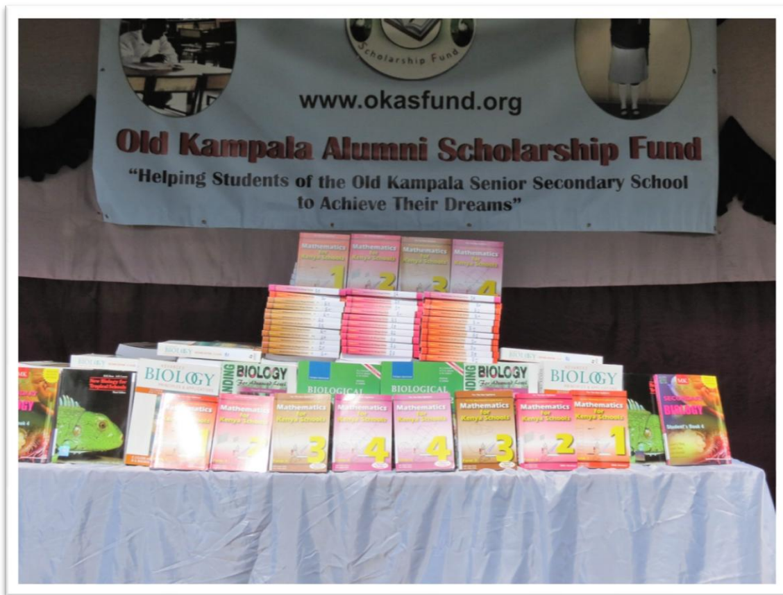
The banner heralds our arrival. All the textbooks just before they were handed over