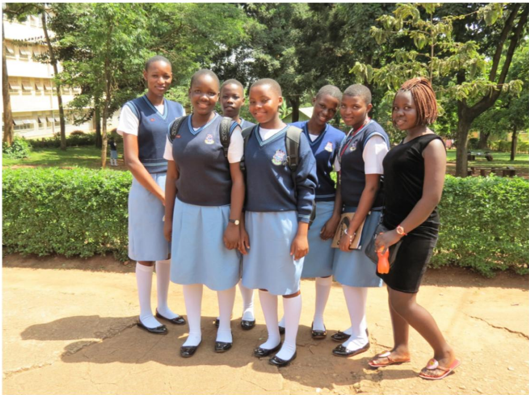
Some of the girls in our scholarship program