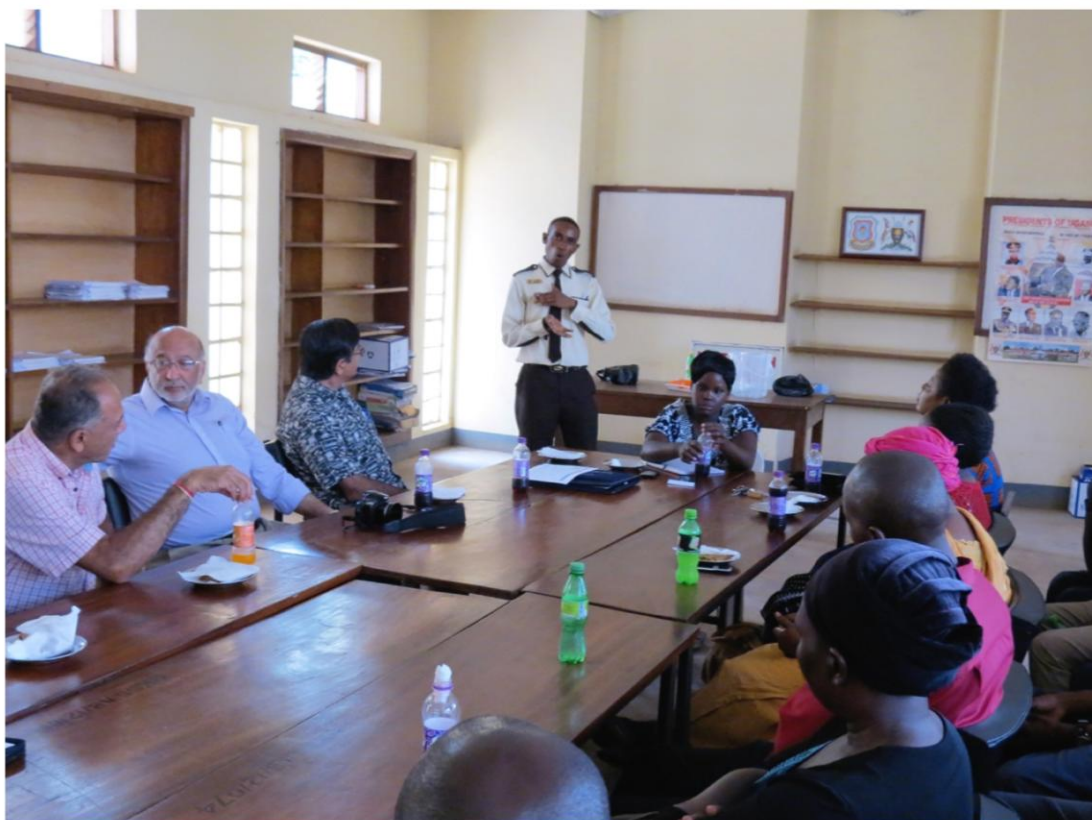
A scholarship student tells us how the program has benefited his studies