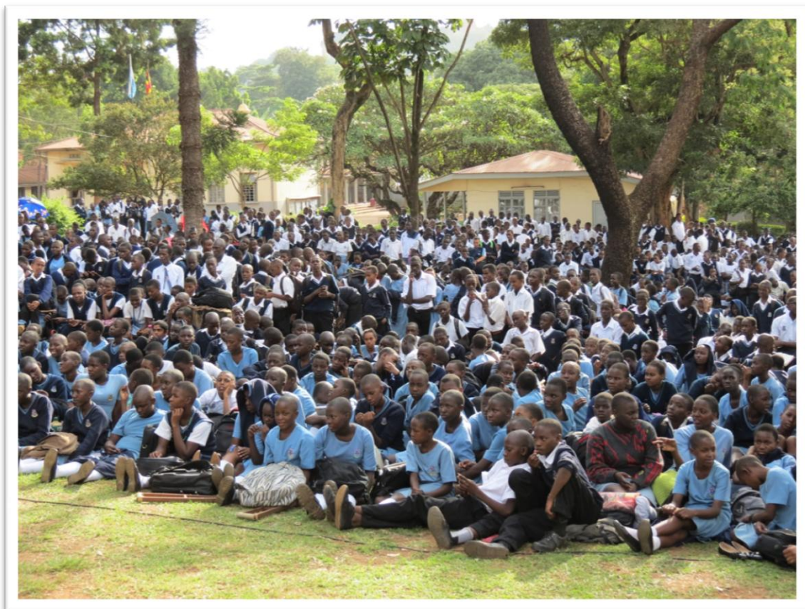
The entire student population, some two thousand strong, was here to observe the proceedings