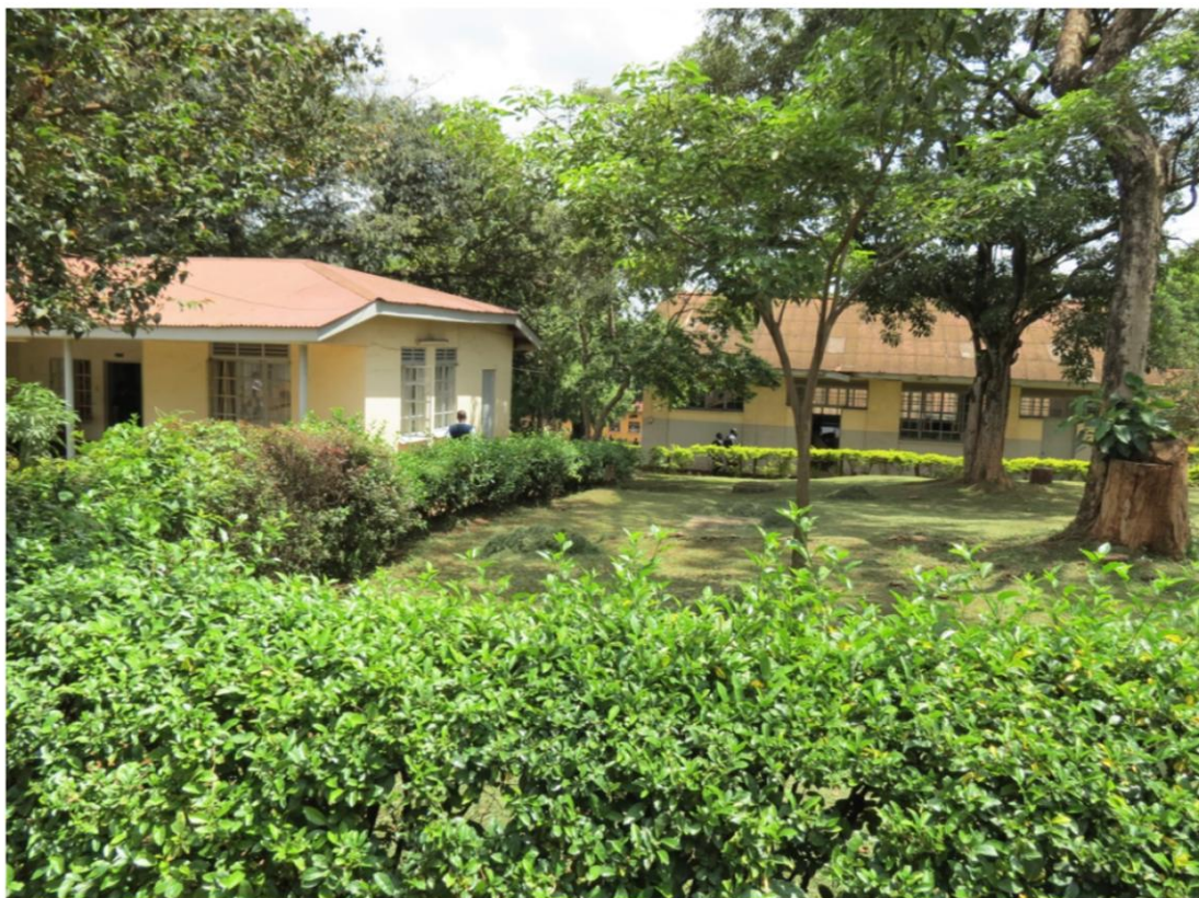
You get to see such lush greenery throughout the year, Kampala being near the equator.