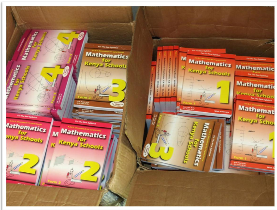
The raw shipment of Mathematics textbooks, one of several boxes...

This pictorial report chronicles our visit, and highlights some of the activities we carried out over three days.